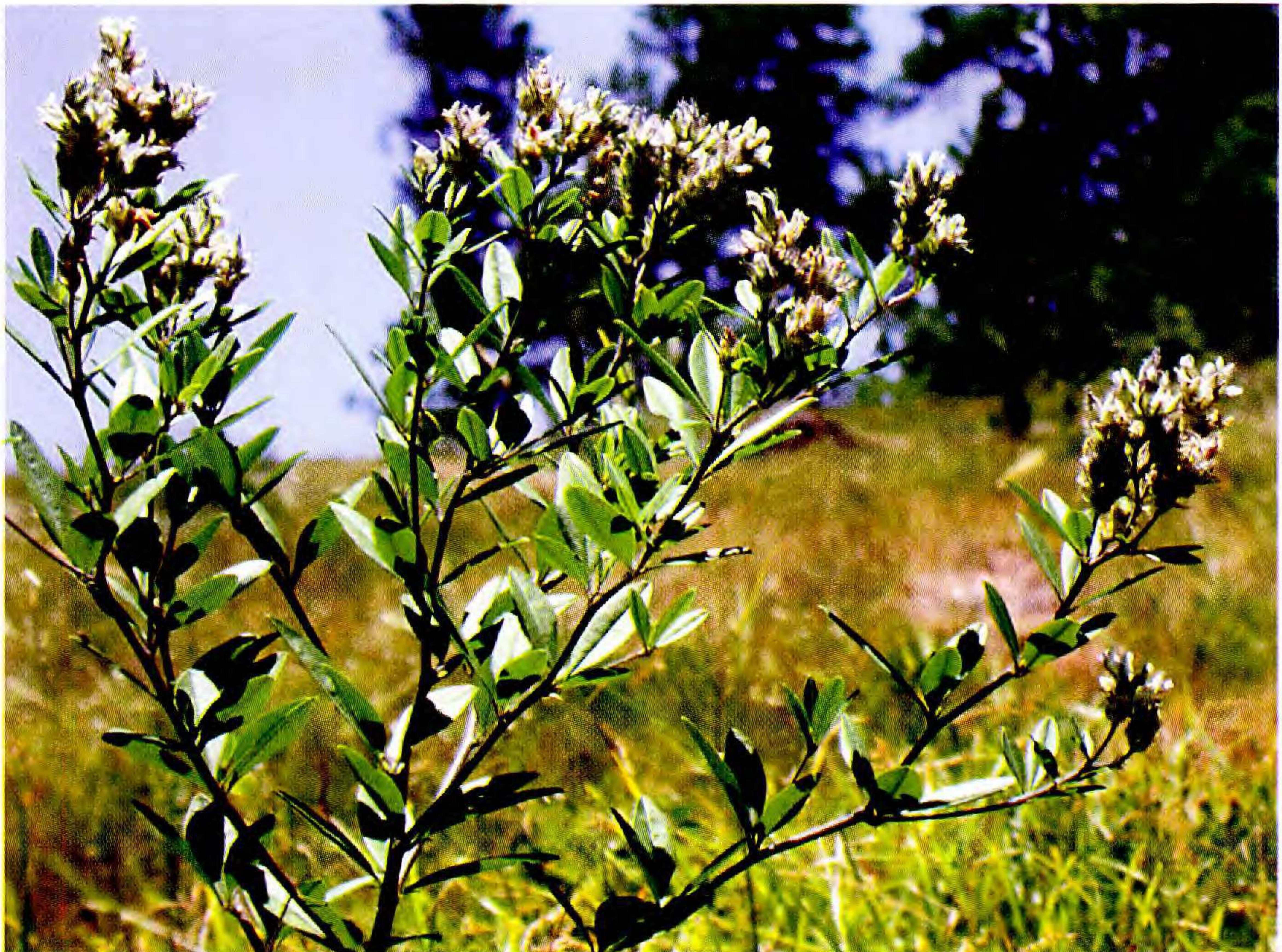
FIG. 1. Upper portion of a plant of Pedimelum piedmontanum , with the characteristic dense, many-flowered inflorescences and leaves all more than twice as long as wide. Columbia County, Georgia, 15 Jun 2002.

Inter species Pedimeli subgeneris Pedimeli sensu Grimesii petiolis brevioribus quam petiolulis ad P. canescens solum accedit, autem simul est P. reverchonio soli simile bracteis floralibus magnis et latissimis et valde caudatis, sed ab ambobus statim distinguitur inflorescentiis densis et multifloris.